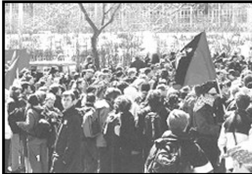
Anti-FTAA demonstration Quebec City, Canada, April 2001

ments they secretly negotiate (such as the North American Free Trade Agreement, the General Agreement on Trade in Services, and the pending Free Trade Area of the Americas) this is an alarming development that could see the spread of western-style, coercive psychiatric practices to the furthest reaches of the world. Cultural annihilation of entire societies, the pathologizing of all forms of political dissent and a global pandemic of disabling neurological disorders resulting from the common psychiatric 'treatments' are among the possible outcomes of any such approach.